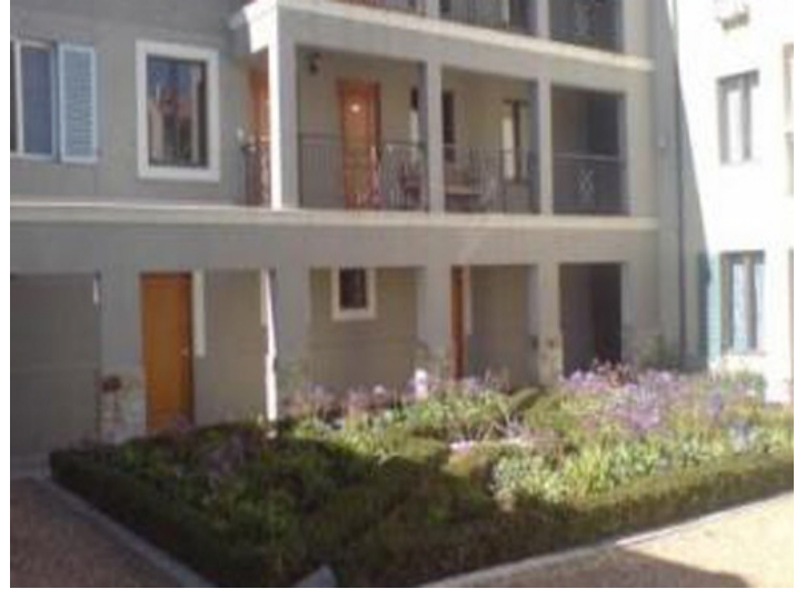
Garden area in the block

Alle Angaben nach bestem Wissen. Irrtum und Zwischenverkauf vorbehalten. Dieses Exposé ist eine Vorinformation, als Rechtsgrundlage gilt allein der notariell abgeschlossene Kaufvertrag.