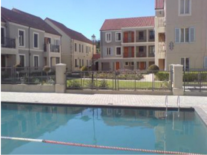
Flat available in Cape Town with community pool