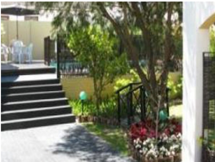
Huge rest area near the pool