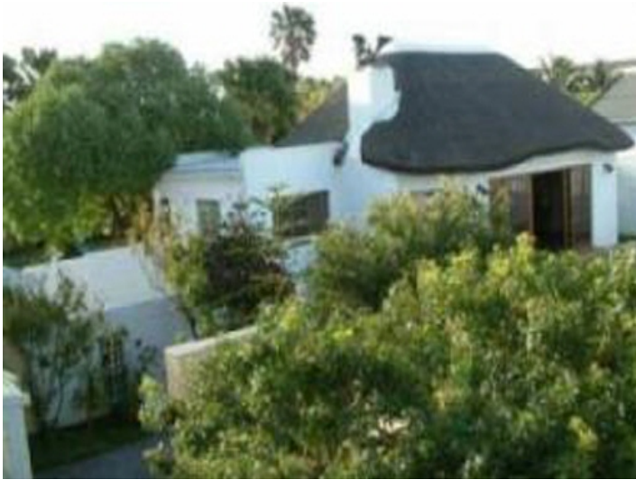
General house view