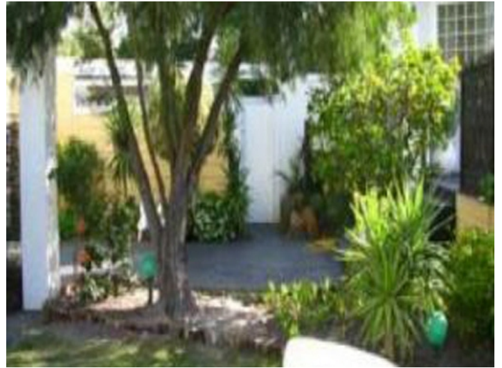
Very nice and cozy garden area