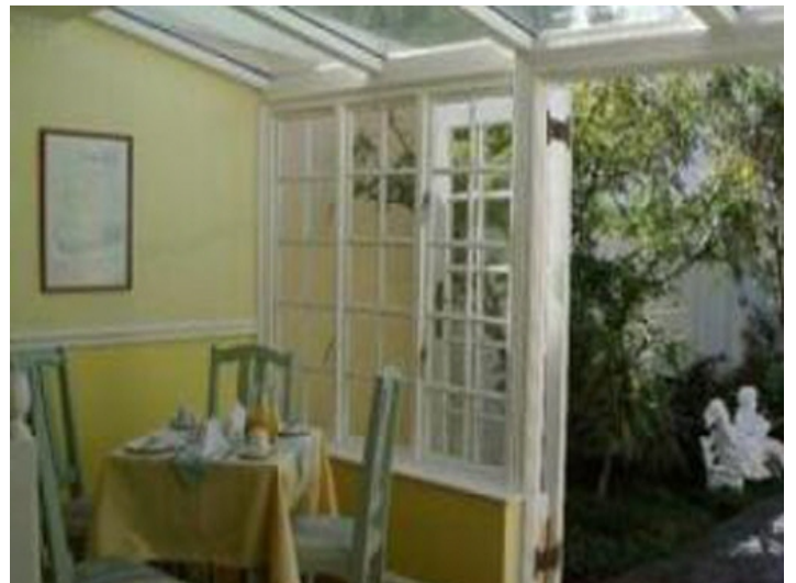
Covered rest area to enjoy your mornings