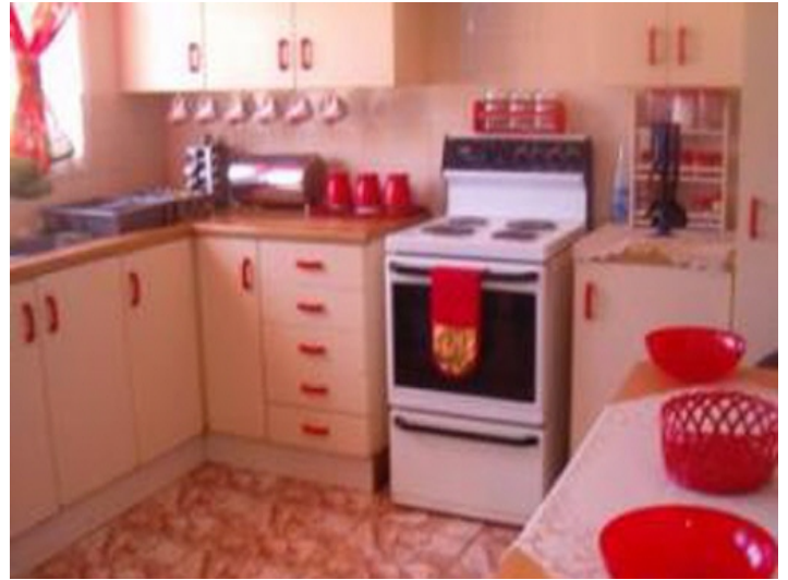
Bright and spacious kitchen area