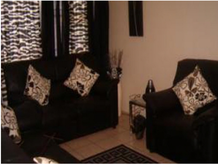
Enjoy your spare time in the huge living room