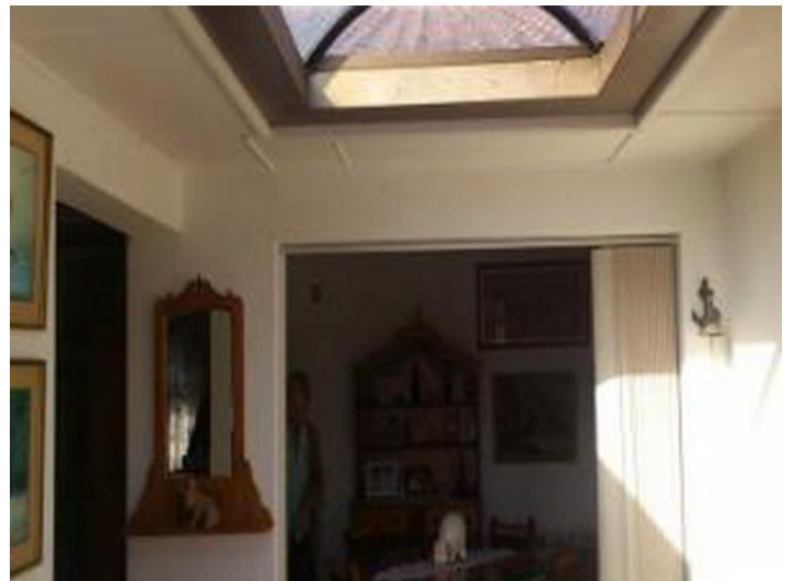
Huge and bright living room