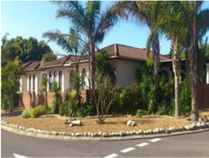
General property view