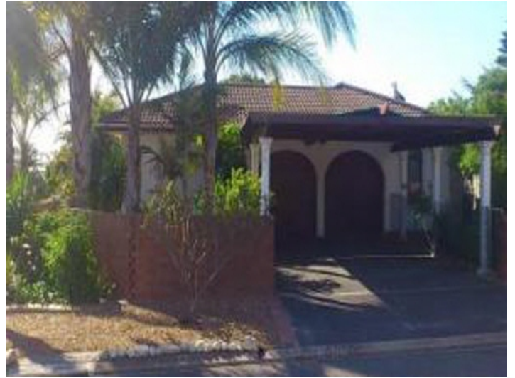
Huge carport in front of the garage