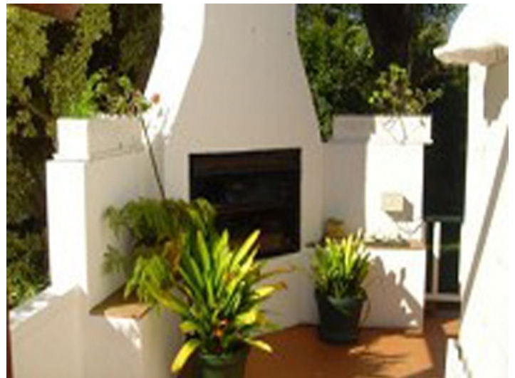
Braai area to spend time with family and friends