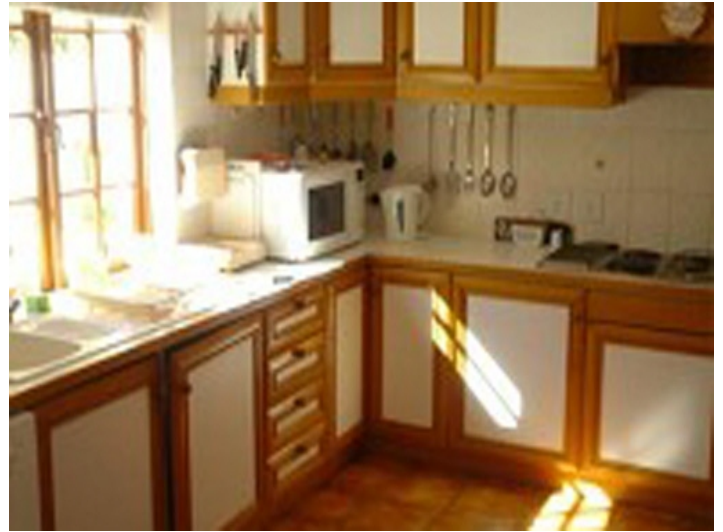
Bright and spacious country style kitchen