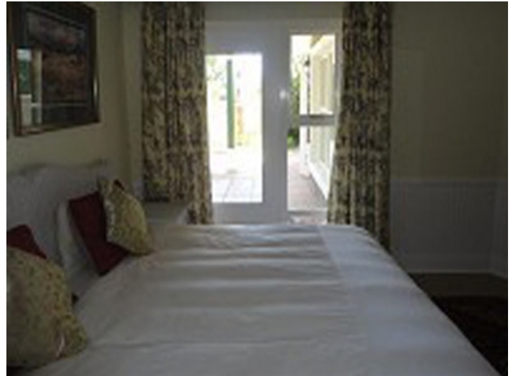
Bedroom with access to the veranda