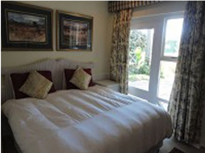
Bedroom with double and comfortable bed