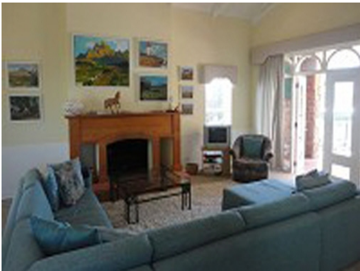
Huge living room with fireplace