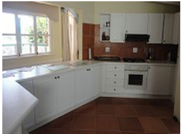
Bright and spacious kitchen