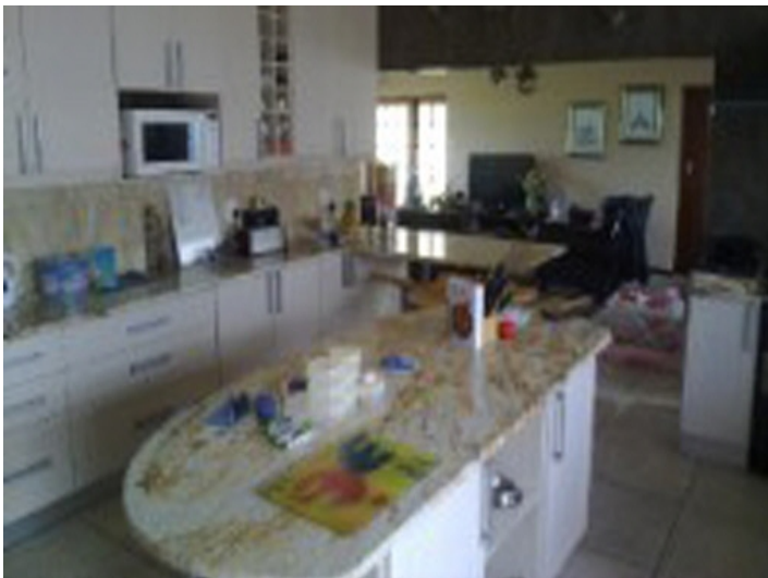
Comfortable and huge kitchen area