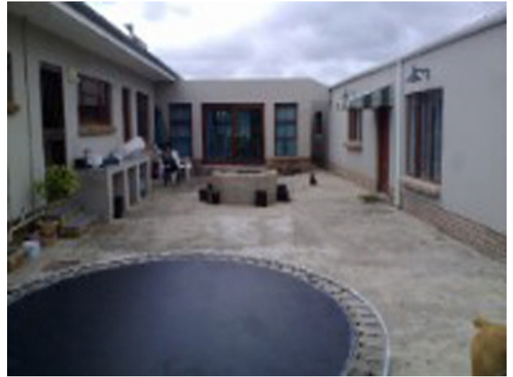
Interior property view