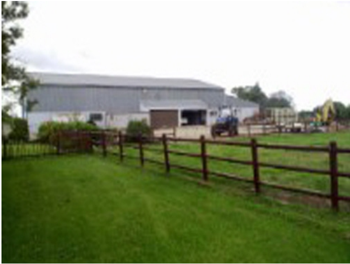
Farm area in George