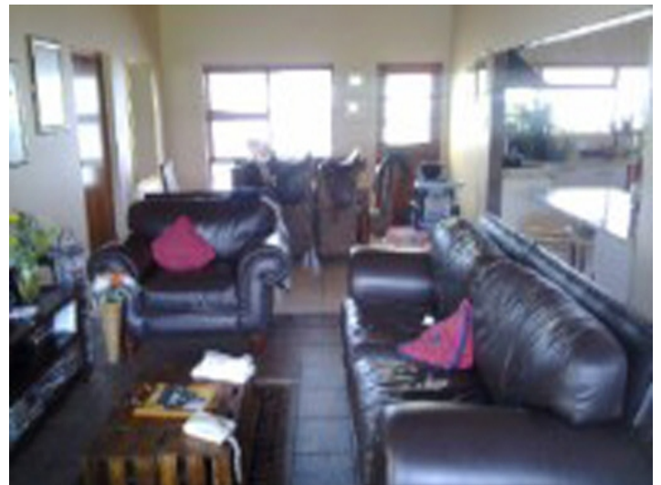
Spacious living area