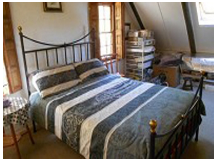
Sunny garden with oak tree and braai