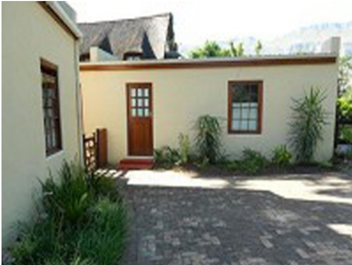
Beautiful views to the mountains