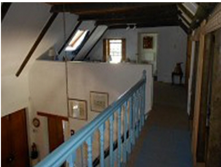
Nice terrace in the property