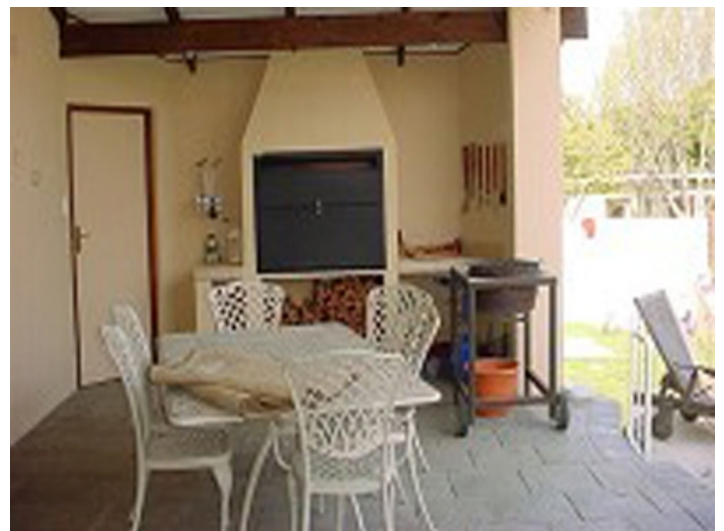
Cozy dining and rest area outside near the pool