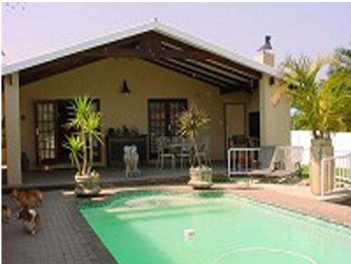
Huge patio near the pool