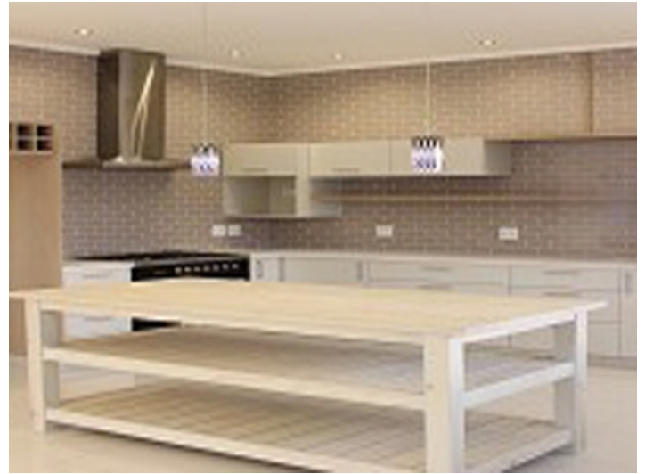
Modern open plan kitchen