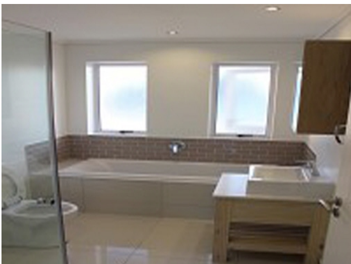
Huge, cozy and modern bathroom

Alle Angaben nach bestem Wissen. Irrtum und Zwischenverkauf vorbehalten. Dieses Exposé ist eine Vorinformation, als Rechtsgrundlage gilt allein der notariell abgeschlossene Kaufvertrag.