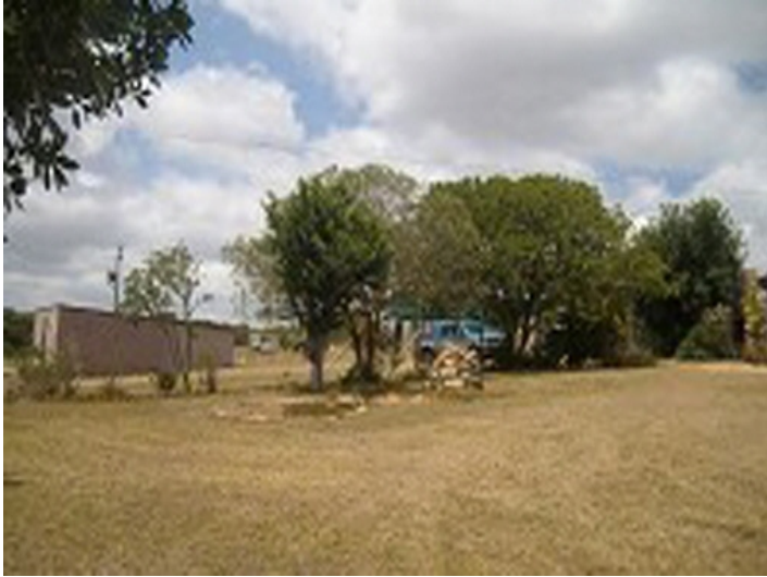
Agricultural land with young olive trees