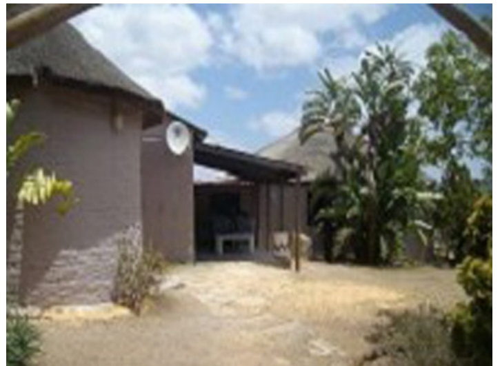
2 rondavel cottages