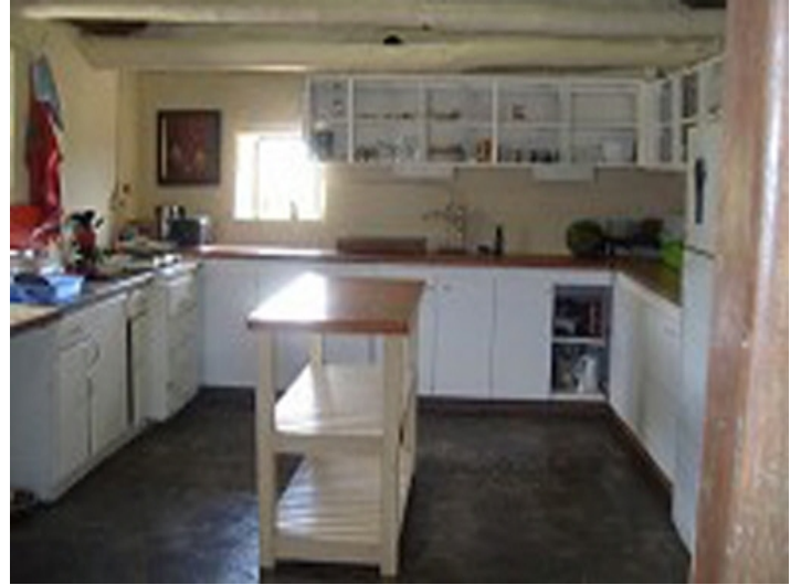
Comfortable and bright kitchen area