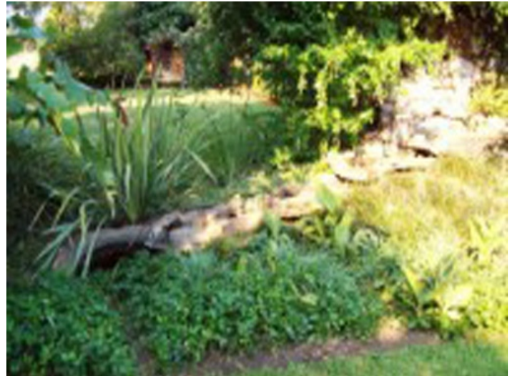
Tropical flora in South Africa