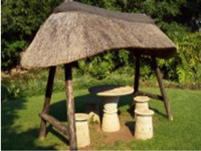
Garden view in the property