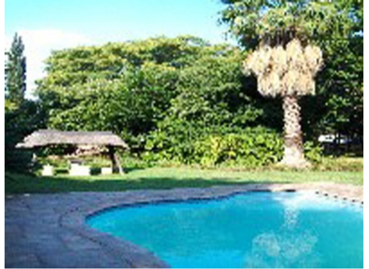
Pool area with beautiful view