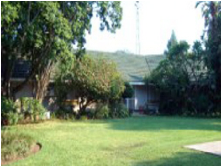
Garden with tropical flora