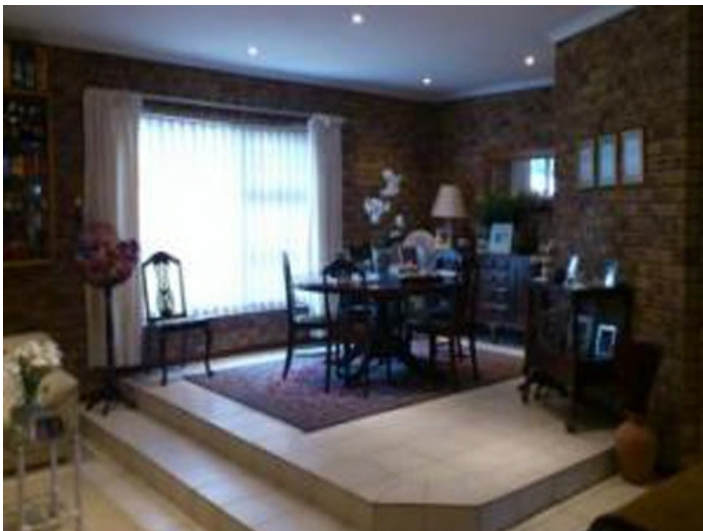
Huge living and dining area