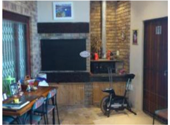
Comfortable rest area with braai