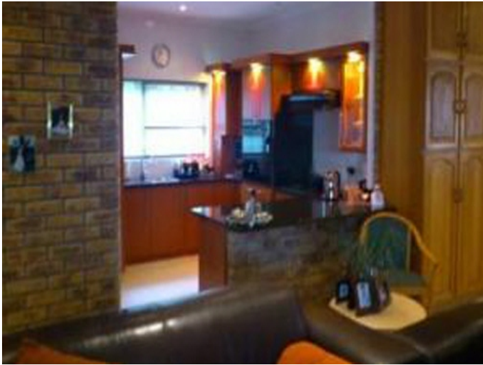
Spacious and well-equipped kitchen