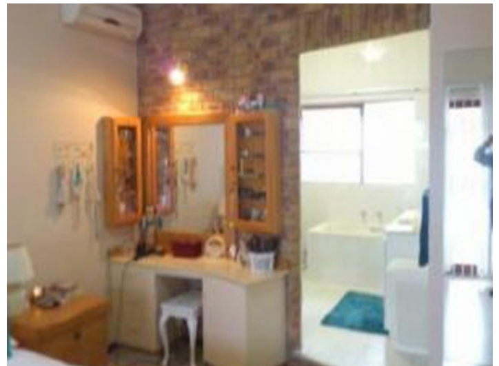
One of the bedrooms with its bathroom